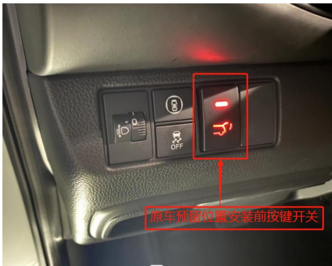
13. Location for front switch.