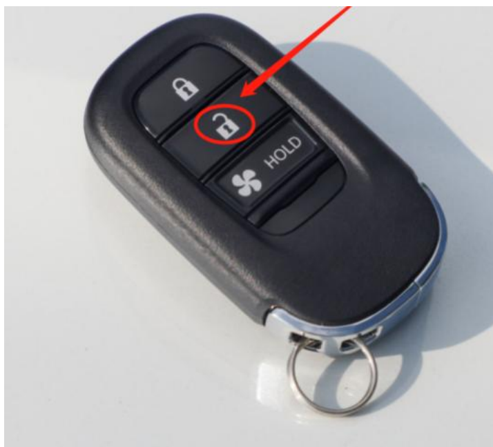
15. Press the unlock button three times to open or close the door.