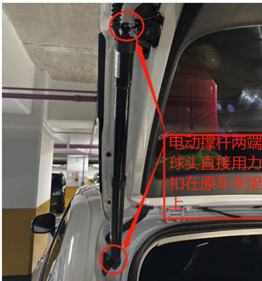
2. The ball heads at both ends of the electric pole are directly buckled on the original car bracket.