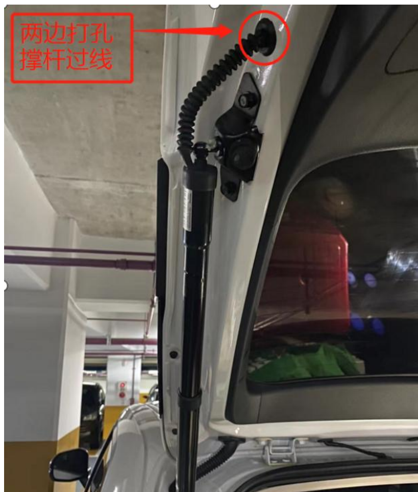
6. Punch holes on both sides through the strut line.