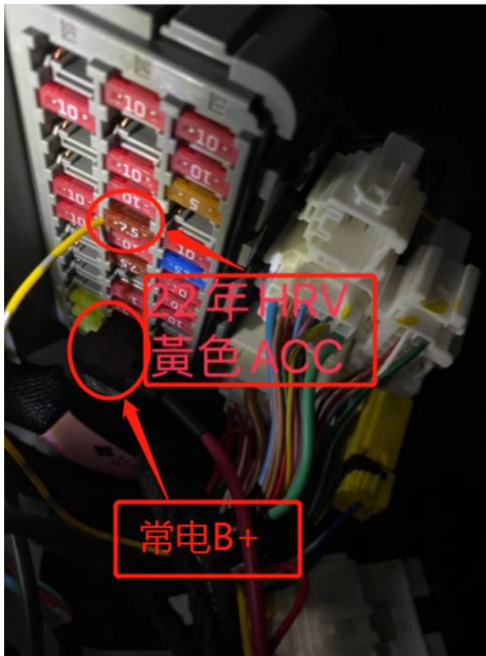
12. Location for Acc and B+.