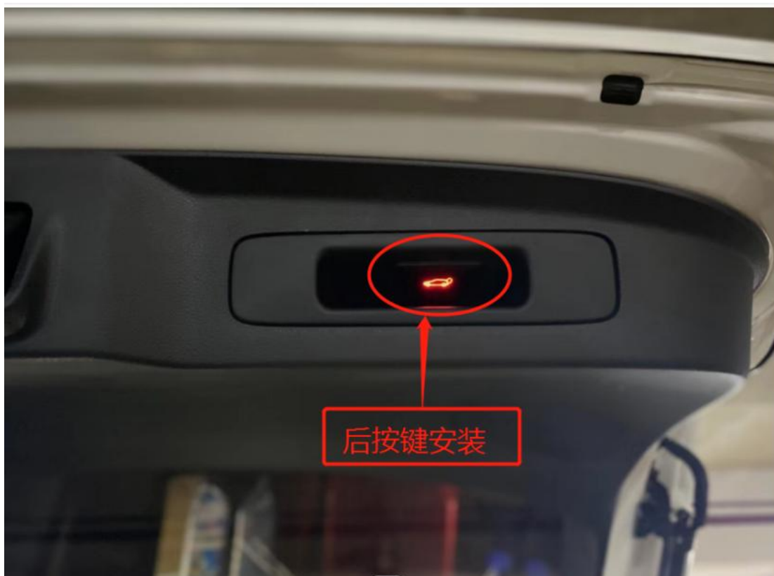
14. Location for rear switch.